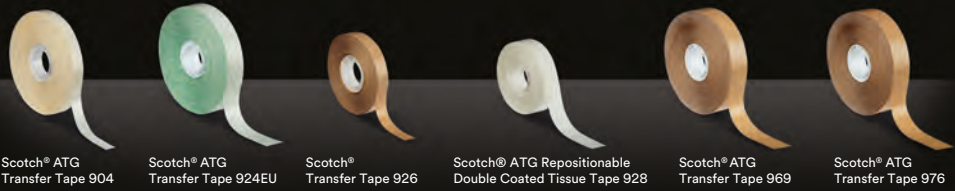
Scotch® ATG Transfer Tape 904 Scotch® ATG Transfer Tape 924EU Scotch® Transfer Tape 926 Scotch® ATG Repositionable Double Coated Tissue Tape 928 Scotch® ATG Transfer Tape 969 Scotch® ATG Transfer Tape 976