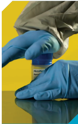
Press down on cap until it clicks