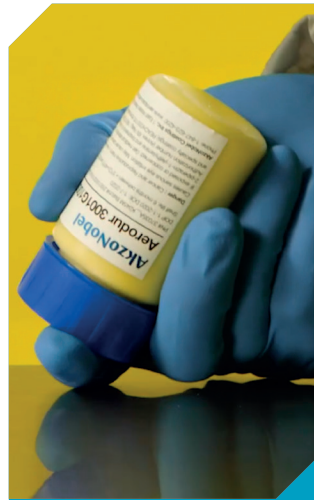
Shake well to mix component