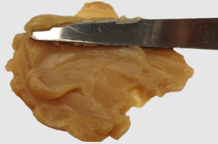
AeroShell Grease 7