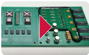
Playlist: Silicones Solutions for E-mobility

Scan the QR codes with your phone's camera to watch the videos on the web.