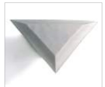
LOCTITE syntactic core machined shape