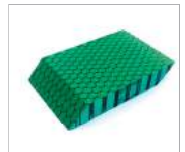
LOCTITE expanding syntactic film